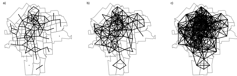
Figure 5: Distance-based neighbours: frequencies of numbers of neighbours by census tract

the three different distance limits. In Syracuse, the census tracts are of similar areas, but were we to try to use the distance-based neighbour criterion on the eight-county study area, the smallest distance securing at least one neighbour for every areal entity is over 38 km.