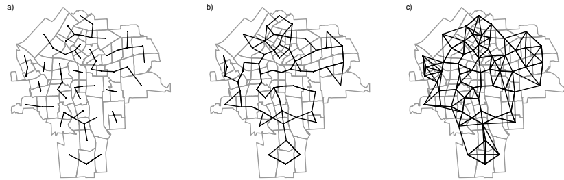
Figure 3: (a) k = 1 neighbours; (b) k = 2 neighbours; (c) k = 4 neighbours